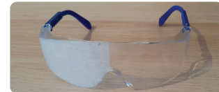
Loss of binocular vision