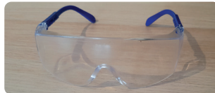
Blurry / Loss of Acuity