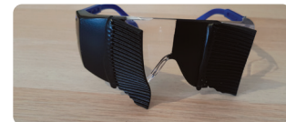
Right or Left Side Blind

"if you can read this you don't need glasses!"